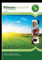
Heat pump brochure