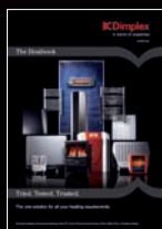
Domestic heating brochure