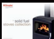
Solid fuel brochure