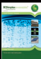
Solar Thermal brochure