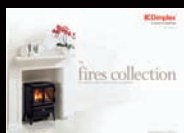
Electric fires brochure

Dimplex offers the widest range of electric space, water heating and renewable solutions in the UK. In addition to this publication, we have a number of more focused brochures as shown below. These can be ordered via our website: www.dimplex.co.uk/support