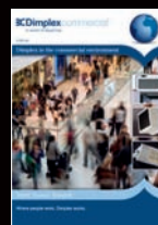
Commercial heating brochure