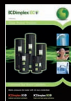
EC-Eau Cylinder brochure