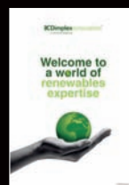
Renewables capabilities brochure