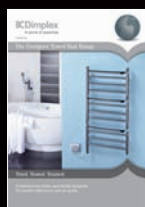
Towel rail brochure